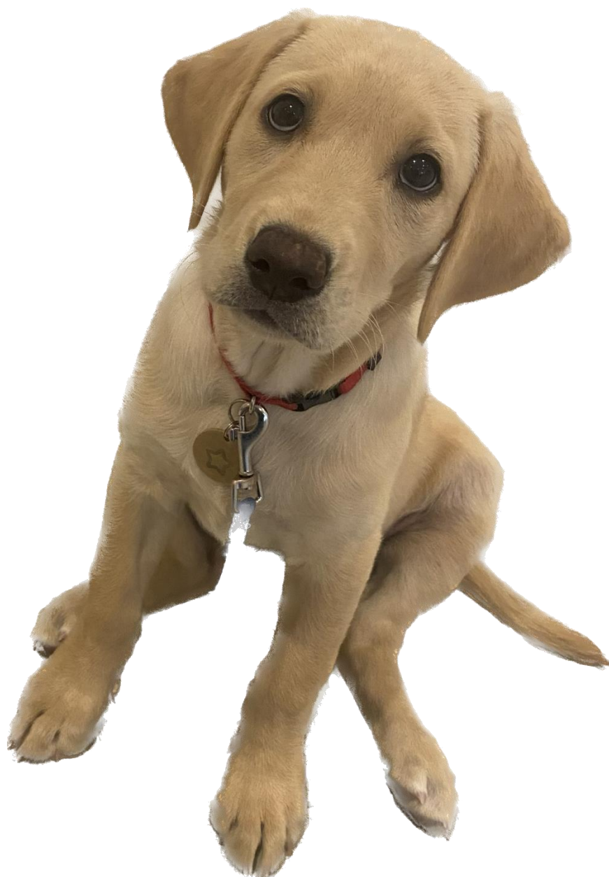
Mabel - aged 11 weeks